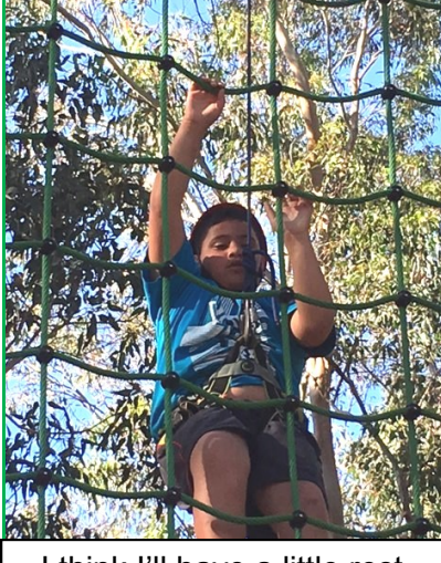
I think I'll have a little rest.