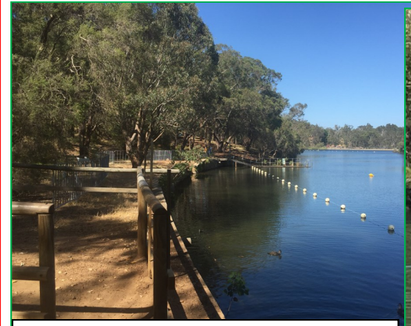
The lake—waiting for the action to begin.